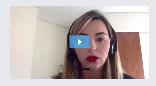
Looking for more insights into the Latin America market? View our discussion here

While there are potential headwinds on the horizon, the stage looks set for regional dealmaking to continue its comeback during the second half of the year.